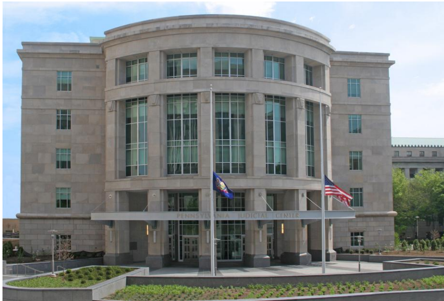
Photo: The Commonwealth Court holds sessions in this building, The Pennsylvania Judicial Center, located in Harrisburg (behind the Capital Building, which houses Superior Court on its 4 th Floor).

The Commonwealth Court is one of Pennsylvania's two statewide intermediate appellate courts (Superior Court is the other one). The Commonwealth Court jurisdiction generally is limited to legal matters involving state and local government and regulatory agencies. Litigation typically focuses on such subjects as banking, insurance and utility regulation and laws affecting taxation, land use, elections, labor practices and workers compensation. Commonwealth Court also acts as a court of original jurisdiction (or a trial court) when lawsuits are filed by or against the Commonwealth.